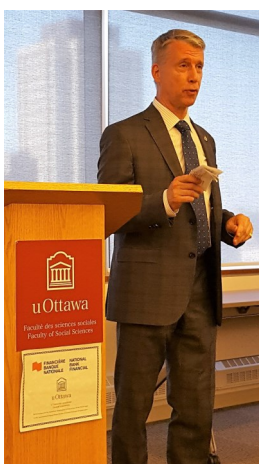
The Honourable Andrew Leslie, Parliamentary Secretary to the Minister of Foreign Affairs (Canada-US Relations) addresses the ICCS Award Reception, University of Ottawa, June 11, 2017